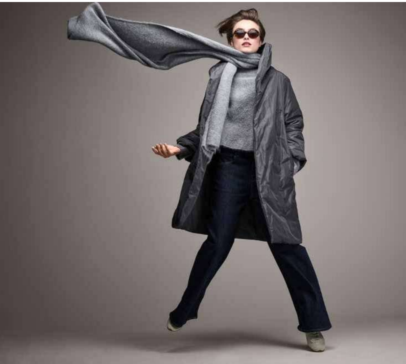
52.MA.03 Alpaca crew neck sweater | 52.MA.05 Alpaca scarf | 52.SO.11 Long puff jacket | 52.IV.82 Wide leg jeans