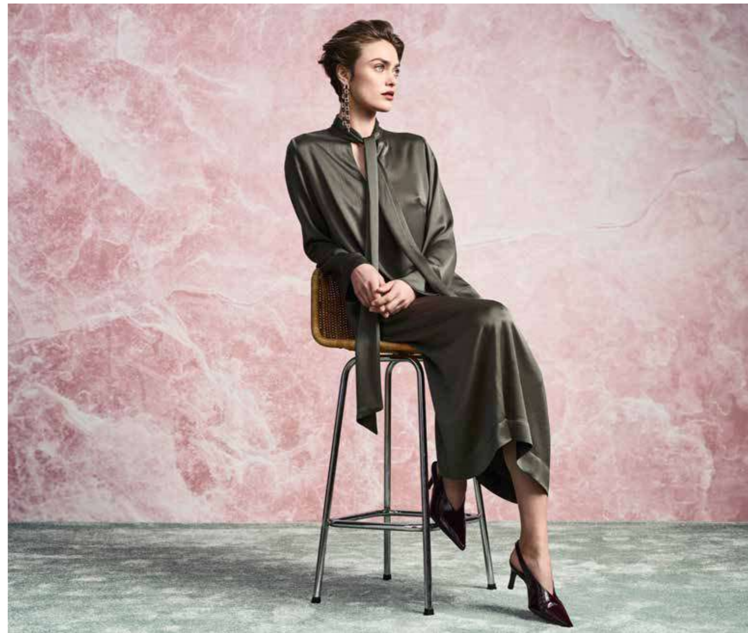
52.HV.03 Hammered viscose shawl neck dress