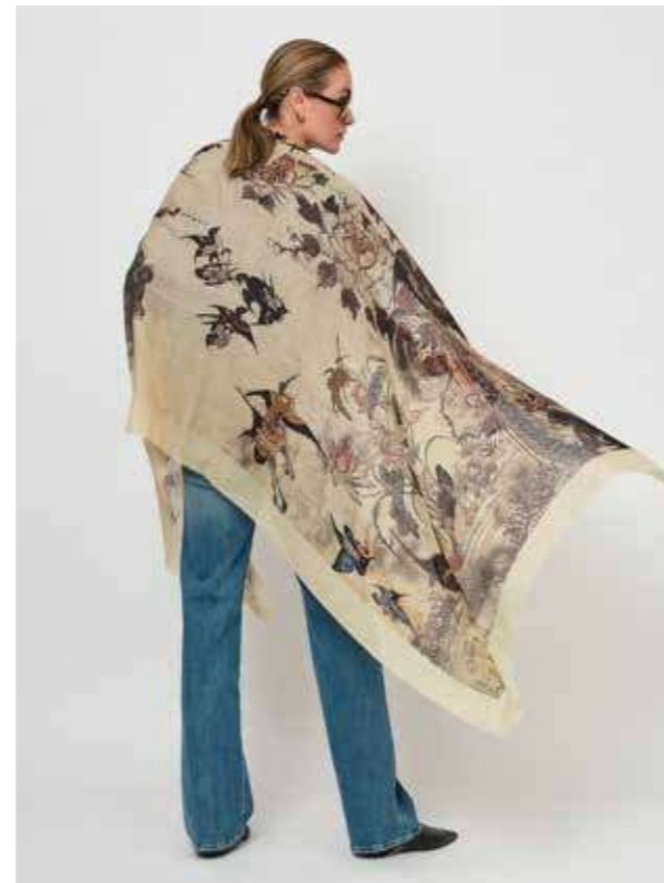
52.BS.14 Nightingale 100% wool