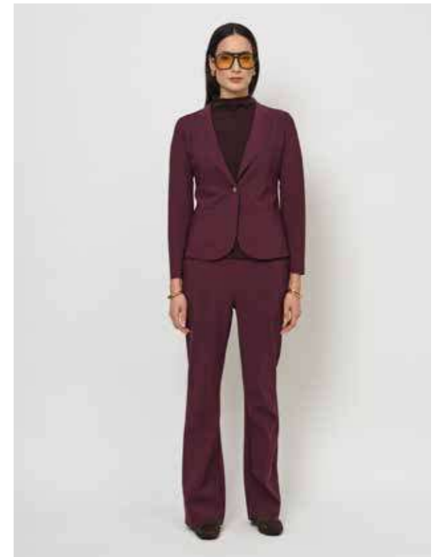
52.PM.13 Cashmere funnel neck sweater | 52.AT.06 Bonded travel quality blazer | 52.AT.07 Bonded travel quality bootleg trousers