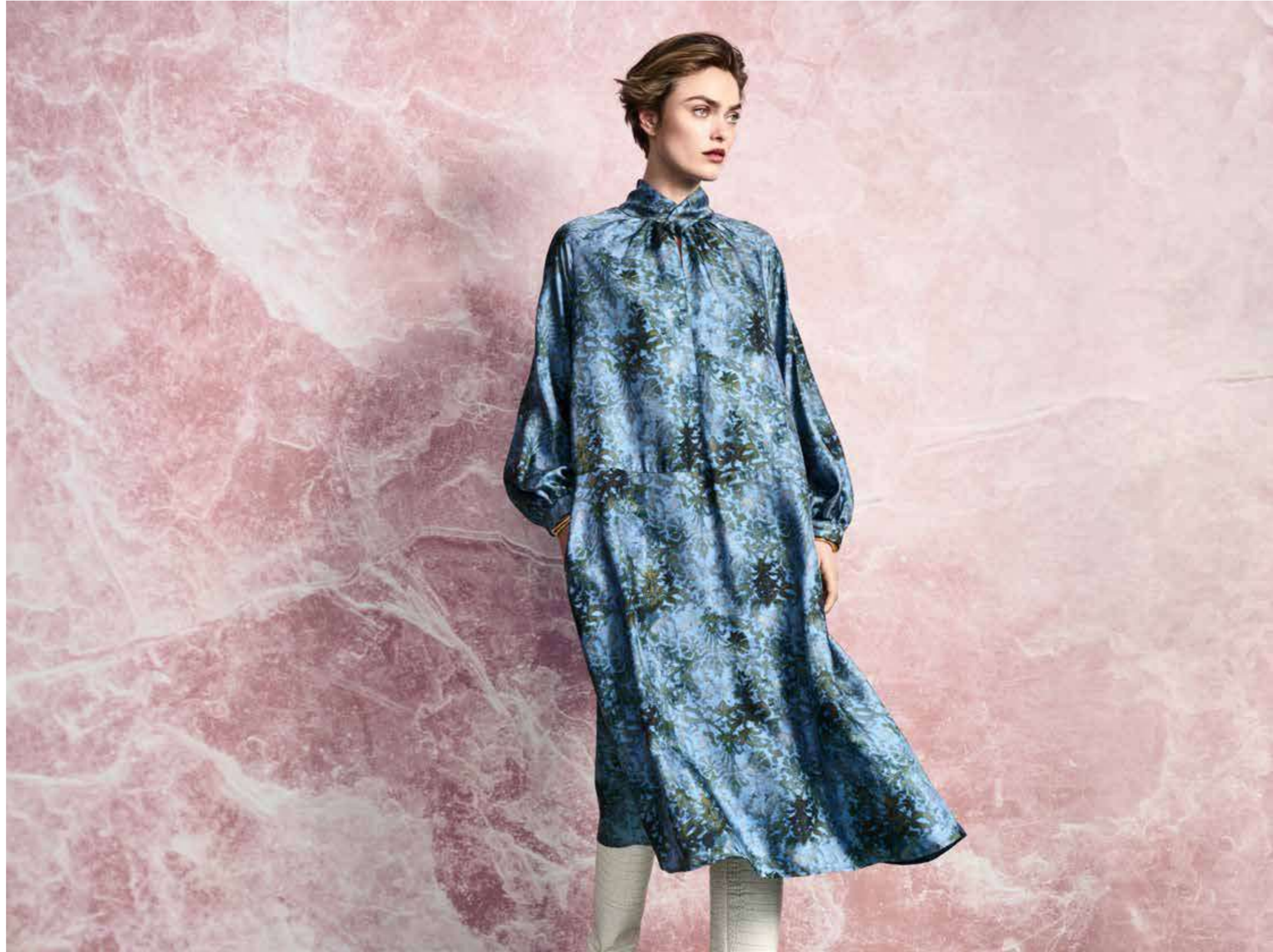
52.SI.05 Silk high neck dress