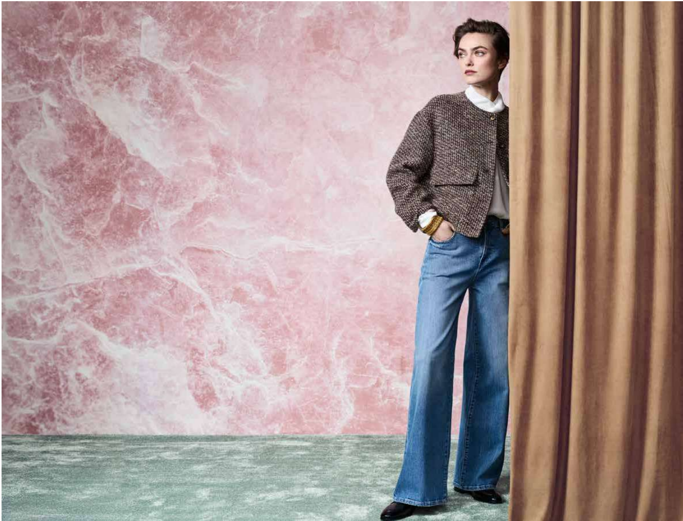
52.SC.30 Boucle bomber jacket | 52.VC.05 Viscose high neck top | 52.IV.82 Wide leg jeans