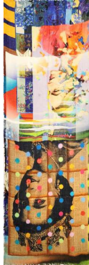
52AH11 - Queen 90% Wool/10% Silk 70 x 180cm