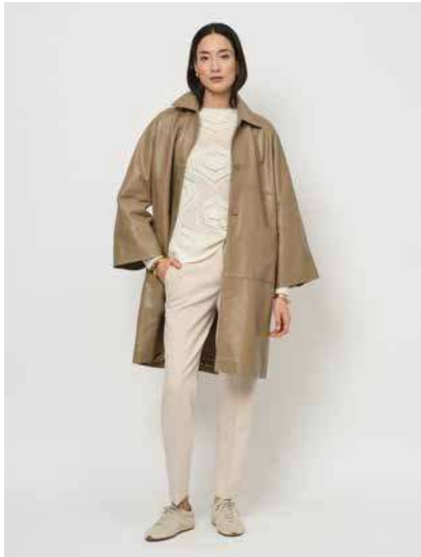
52.FK.01L Leather jacket | 52.MA.12 Wool crew neck crochet sweater | 52.RA.11 Viscose blend slim fit trouser