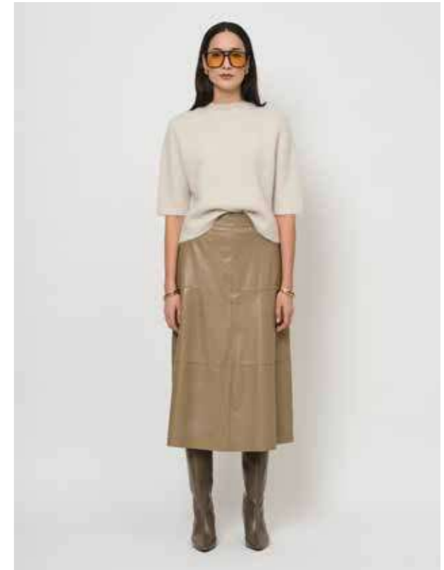
52.MA.04 Alpaca short sleeve sweater | 52.FK.05L Leather A-line skirt