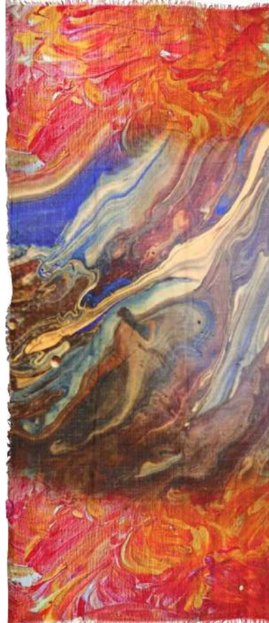
52AH02 - Marble 75% Wool/25% Modal 100 x 180cm