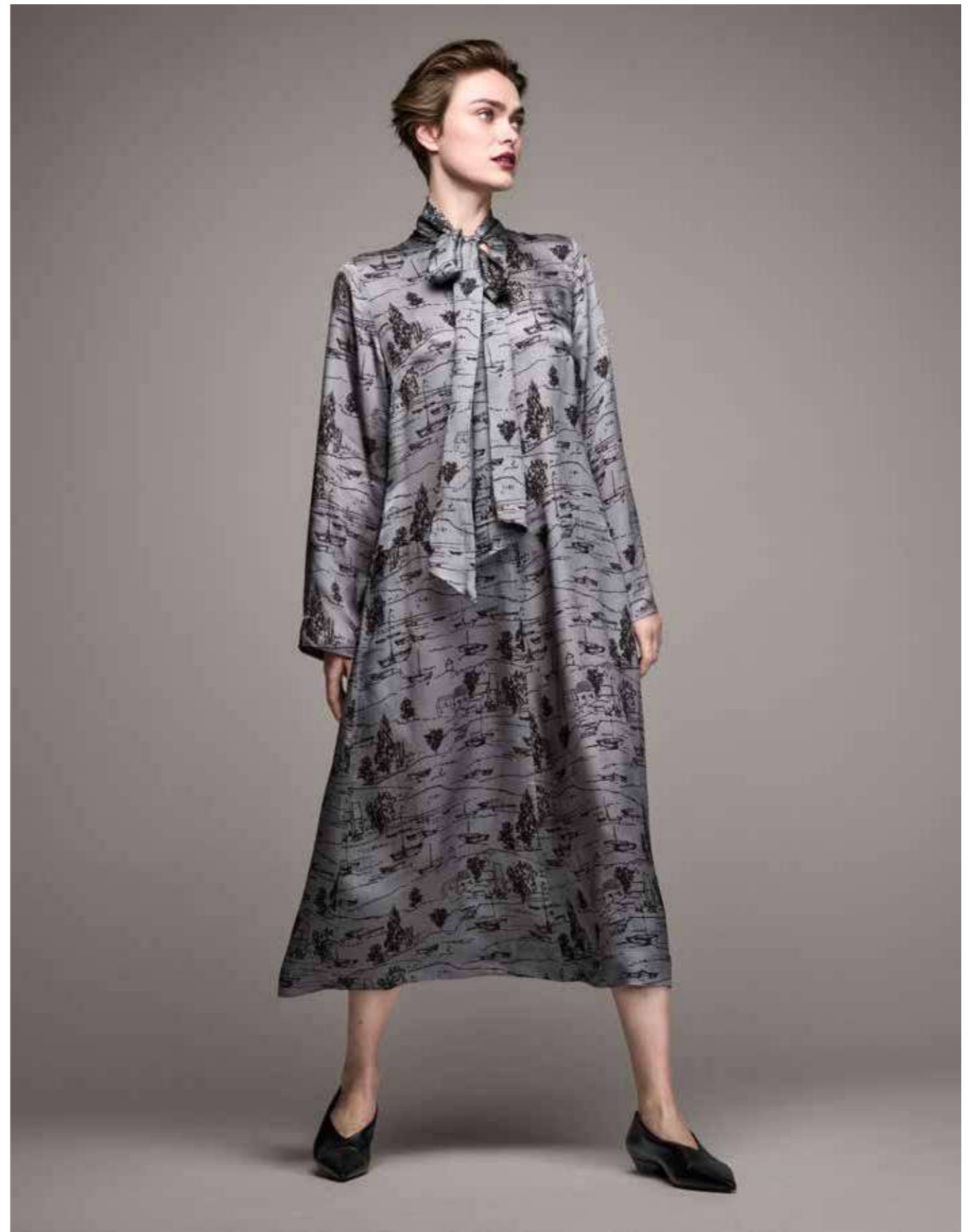
52.HP.03 Printed shawl neck viscose dress