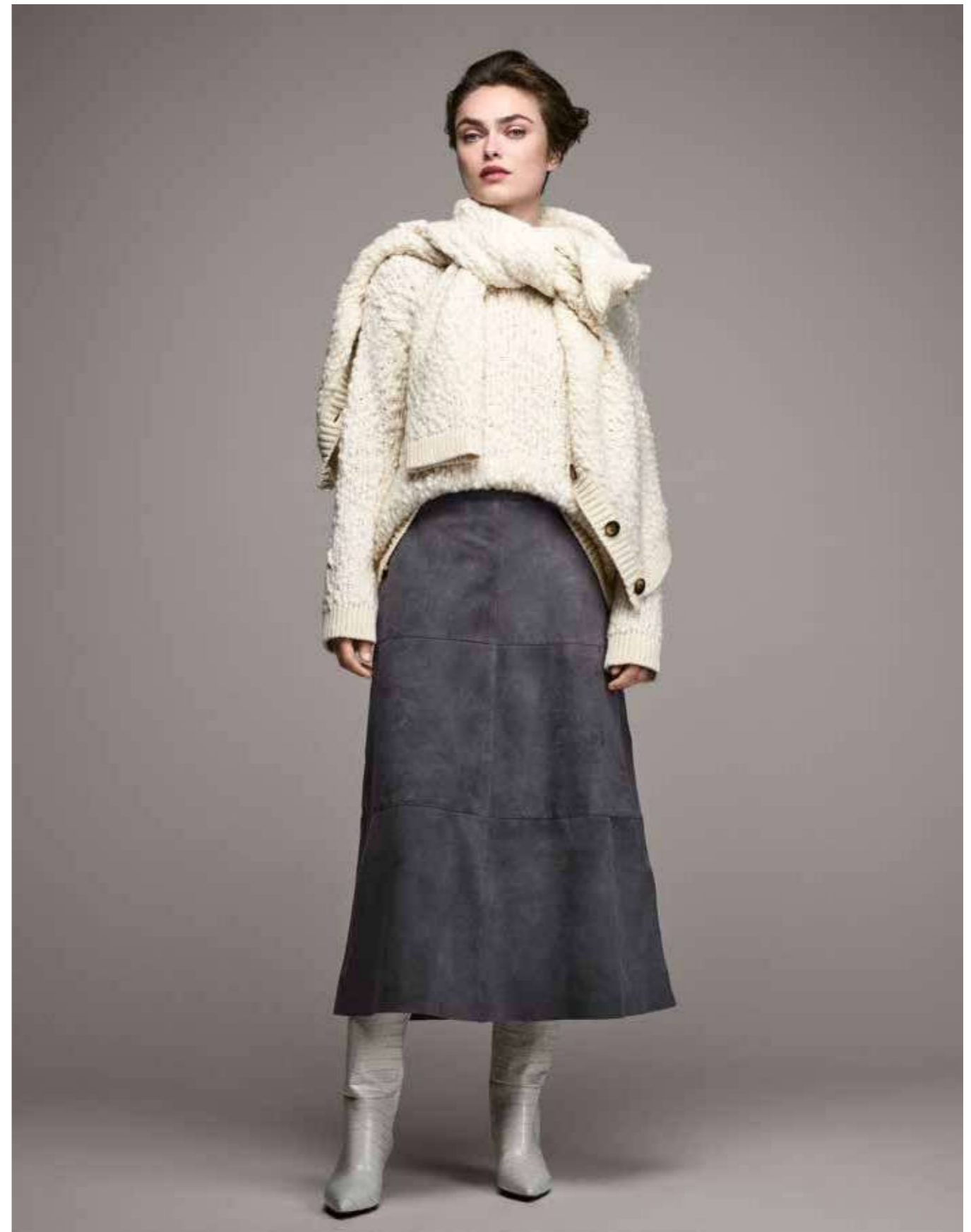
52.FM.05 Alpaca bubble knit cardigan | 52.FM.06 Alpaca bubble knit sweater | 52.FK.05S Suede A-line skirt