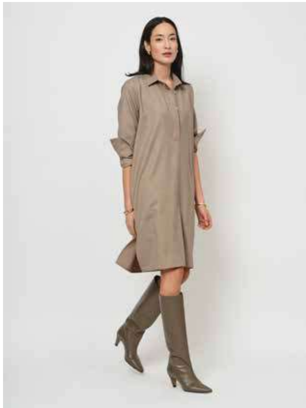
52.WO.07 Wool blend long sleeve shirt dress