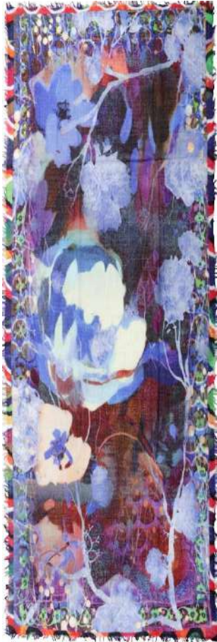
52AH37 - Tulip 100% Wool 70 x 180cm