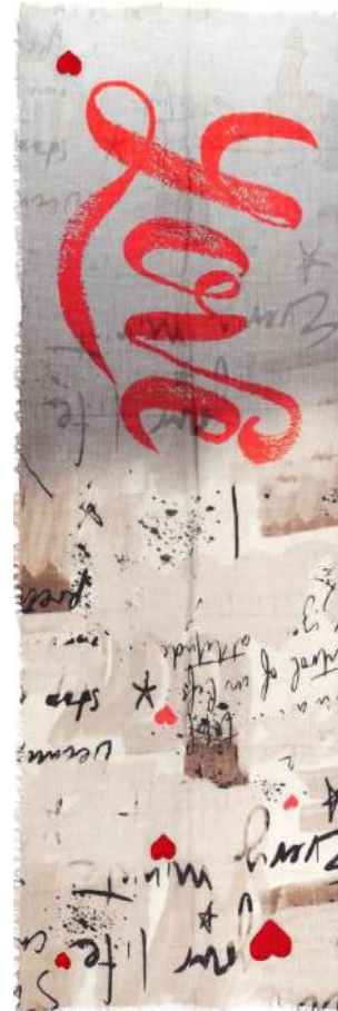
52AH17 - Love Letter 75% Wool/25% Modal 70 x 180cm