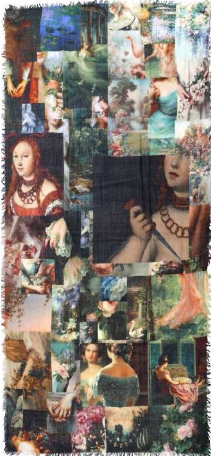
52AH43 - Art 100% Wool 100 x 180cm