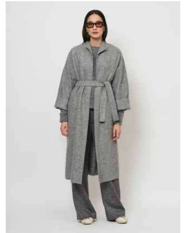
52.FM.08 Alpaca crew neck sweater | 52.WP.04 Wool punto wide leg trousers | 52.RA.15 Boiled wool long jacket