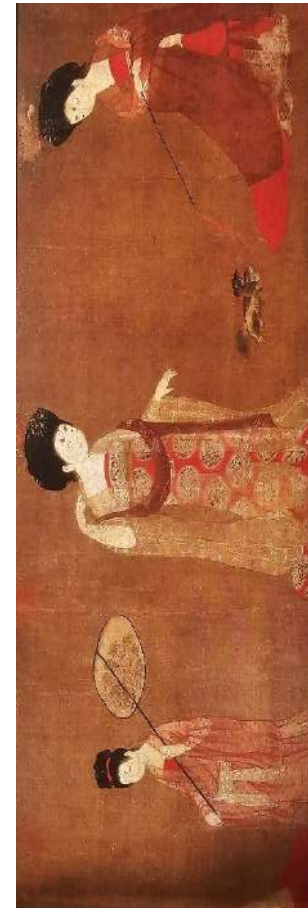
52BS03 - Geisha/Dragonfly 80% Modal/20% Silk 70 x 180cm