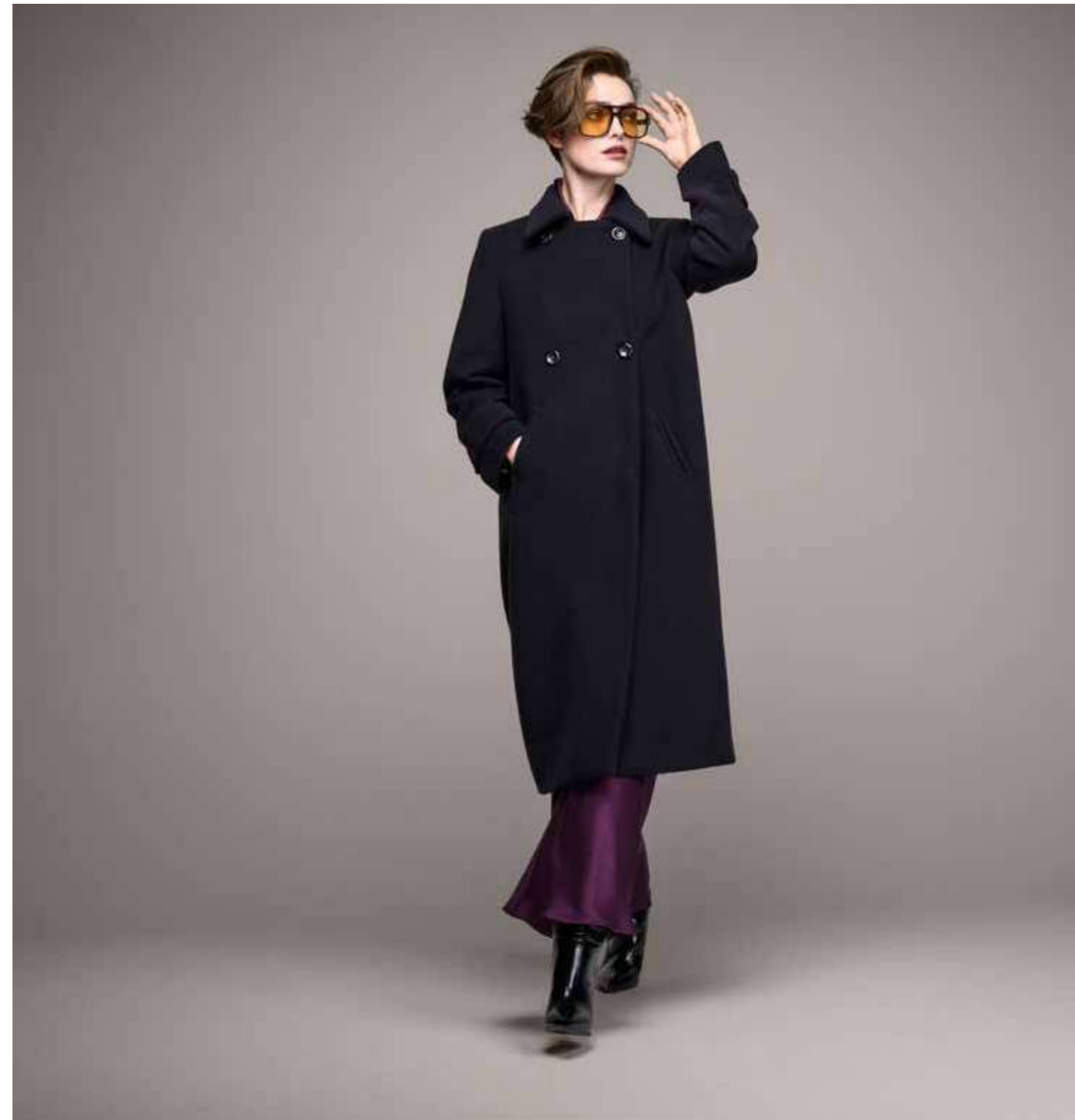
52.RA.02 Wool/cashmere coat | 52.HV.05 Hammered viscose skirt | 52.HV.07 Hammered viscose top