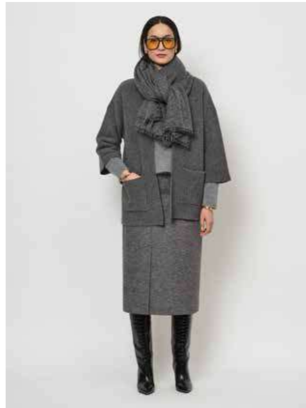
52.GB.01 Wool/cashmere cardigan | 52.MA.03 Alpaca crew neck sweater | 52.WP.03 Wool punto pencil skirt | 52.TN.05 Cashmere scarf