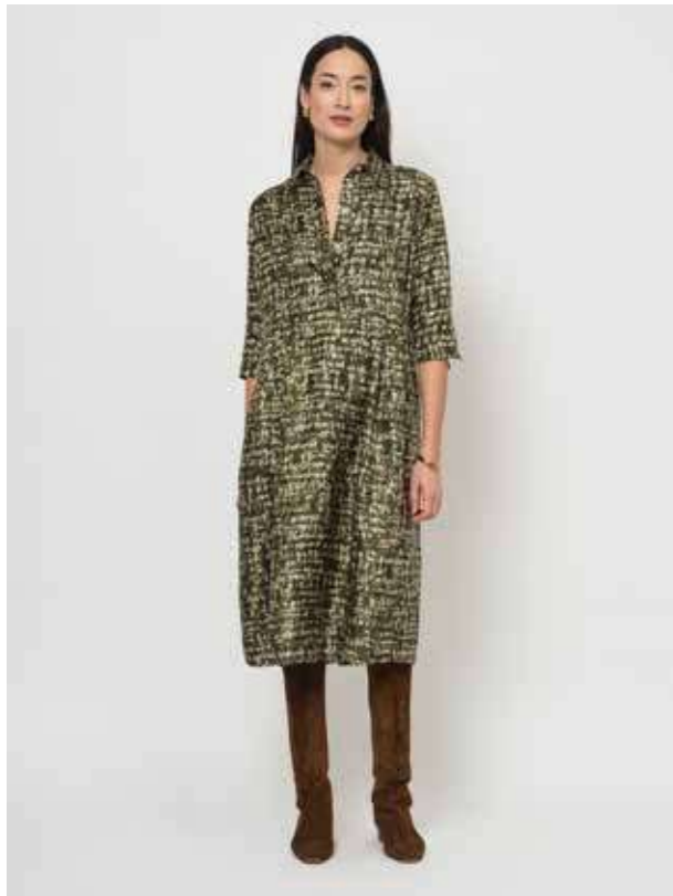
52.SI.08 Silk pleated shirt dress