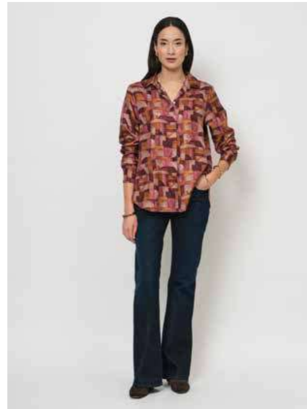
52.SI.03 Relaxed silk shirt | 52.IV.81 Bootcut jeans