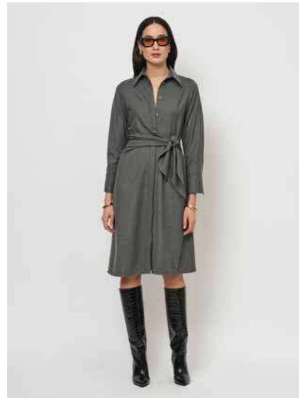
52.WO.06 Wool blend shirt dress