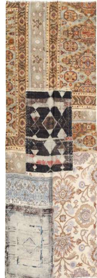
52AH12 - Carpet Yellow 90% Wool/10% Silk 70 x 180cm