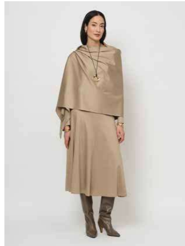
52.MC.03 Tencel boat neck top | 52.MC.05 Tencel panel skirt 52.MC.07 Tencel scarf