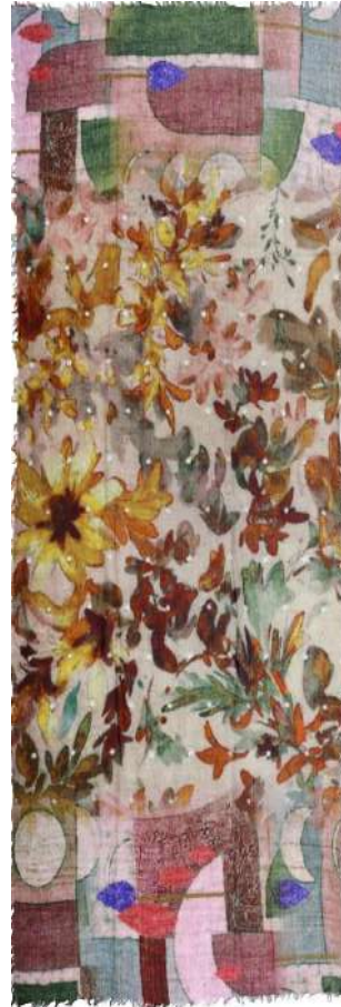
52AH38 - Leaves 100% Wool 70 x 180cm