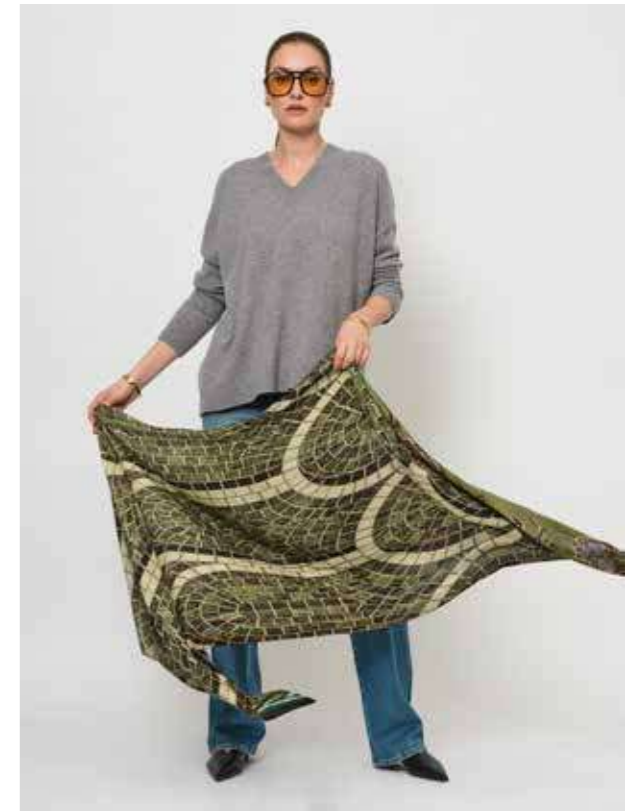
52.BS.05 Double sided scarf - Paradise 80% modal/20% silk