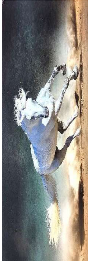
52BS04 - Horse 80% Modal/20% Silk 70 x 180cm