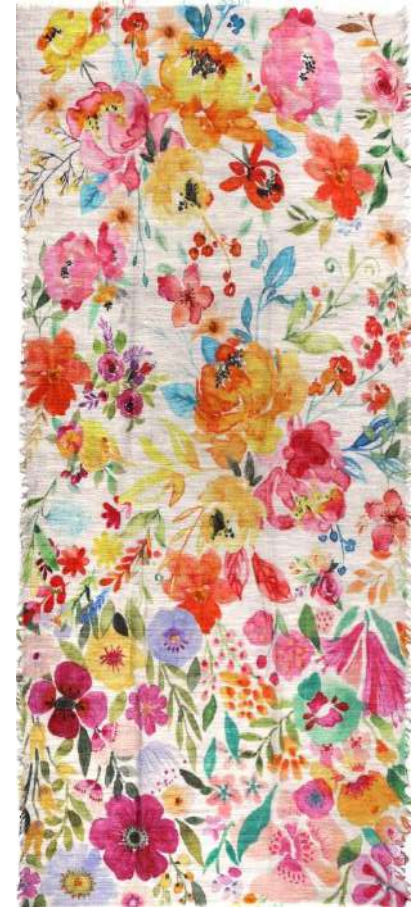
52AH36 - Watercolor 100% Wool 100 x 180cm