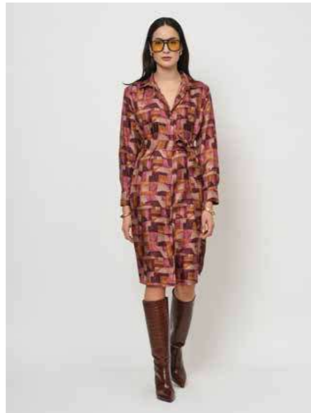
52.SI.04 Silk shirt dress