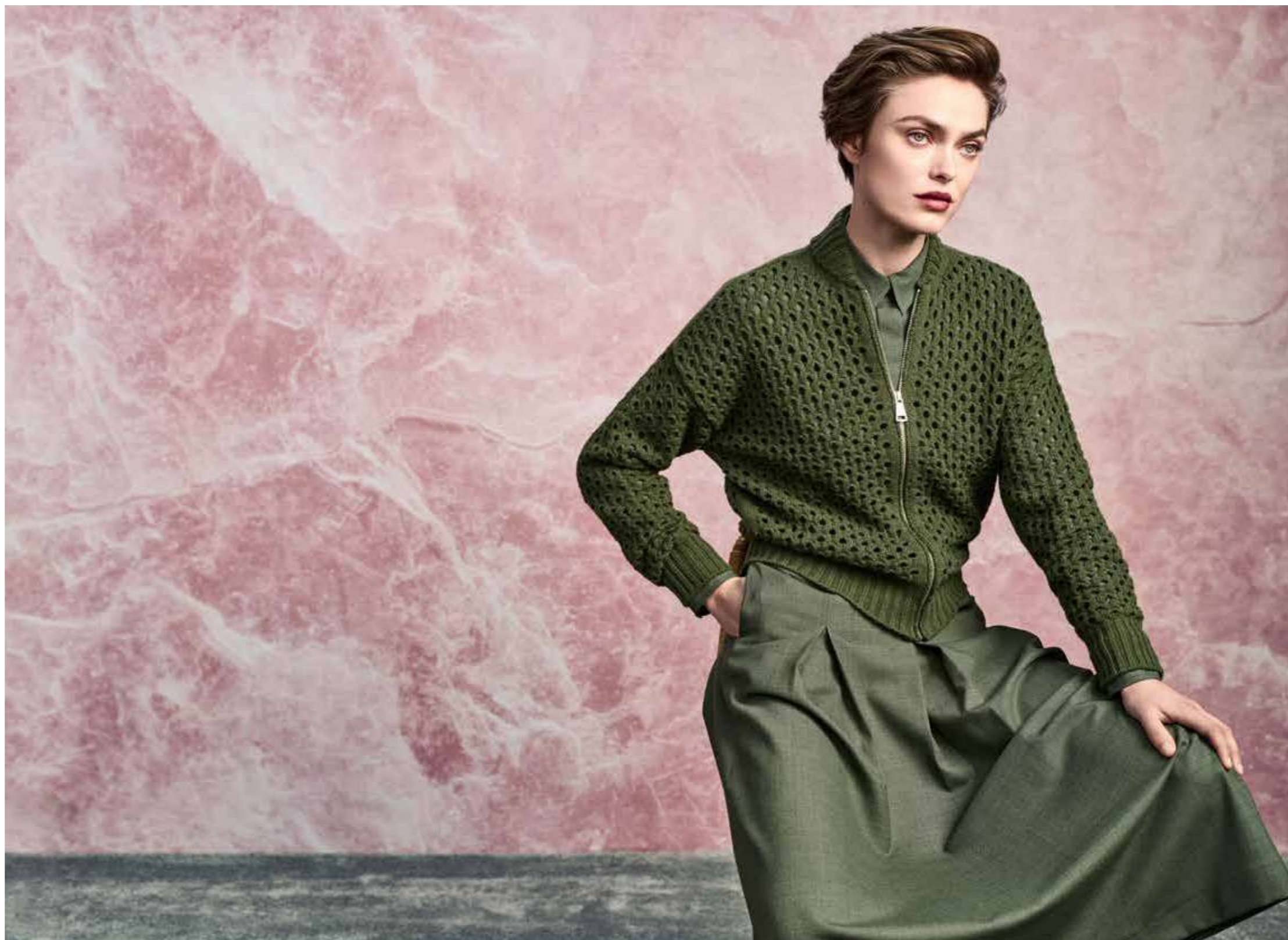
52.CA.04 Perforated cashmere blend cardigan | 52.WO.03 Wool blend shirt | 52.WO.10 Wool blend skirt with pleats