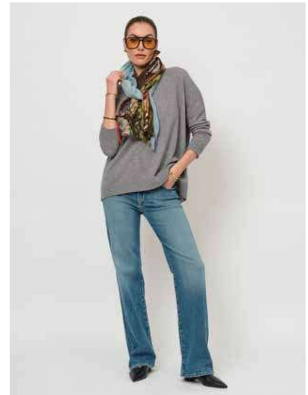
52.BS.08 Amsterdam 100% wool