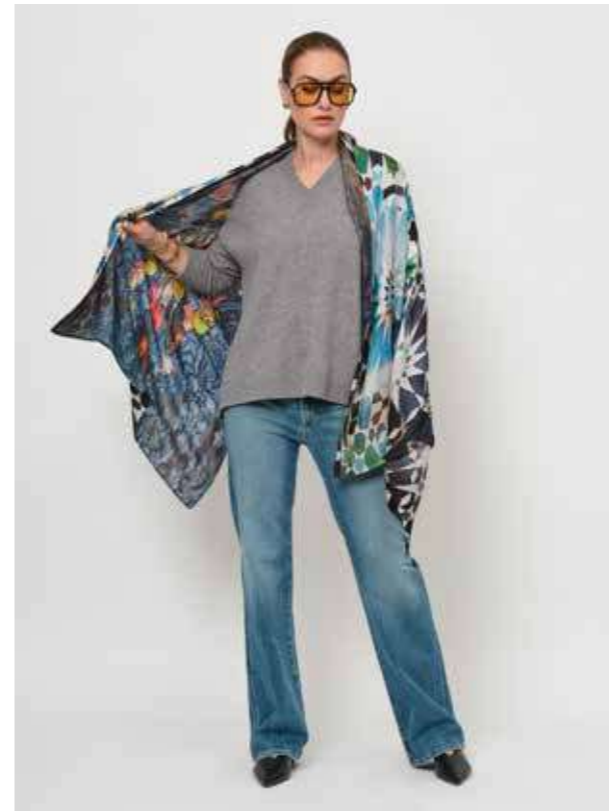
52.BS.01 Double sided scarf - Flowers and Tiles 80% modal/20% silk