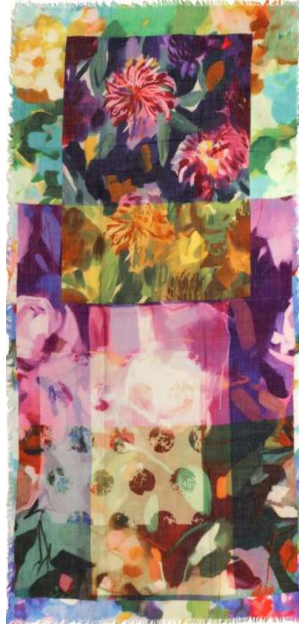
52AH44 - Collage 100% Wool 100 x 180cm