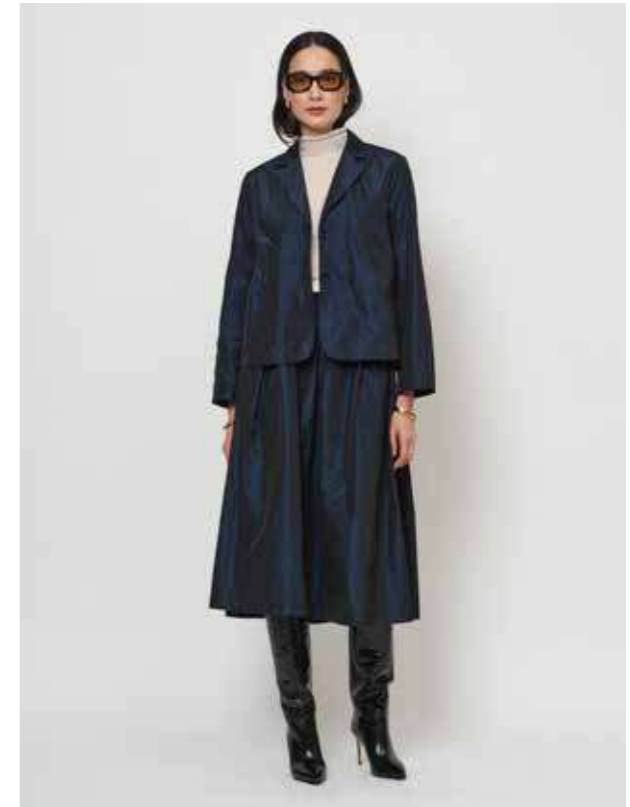
52.MA.09 Merino wool high neck sweater | 52.IV.63 Taffeta short lapel jacket | 52.IV.61 Taffeta box pleat skirt