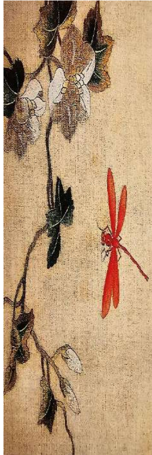
52BS03 - Geisha/Dragonfly 80% Modal/20% Silk 70 x 180cm