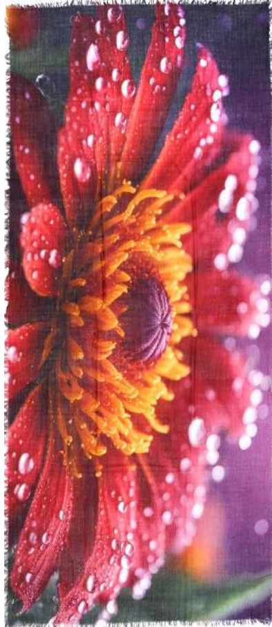
52AH07 - Coneflower 75% Wool/25% Modal 100 x 180cm