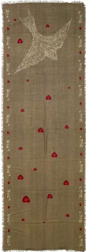
52AH16 - Taupe 100% Wool 70 x 180cm