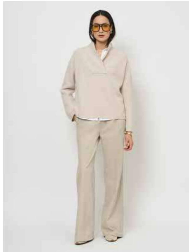
52.AN.02 Cashmere blend V-neck sweater | 52.RA.17 Cotton trouser 52.MC.03 Tencel polo