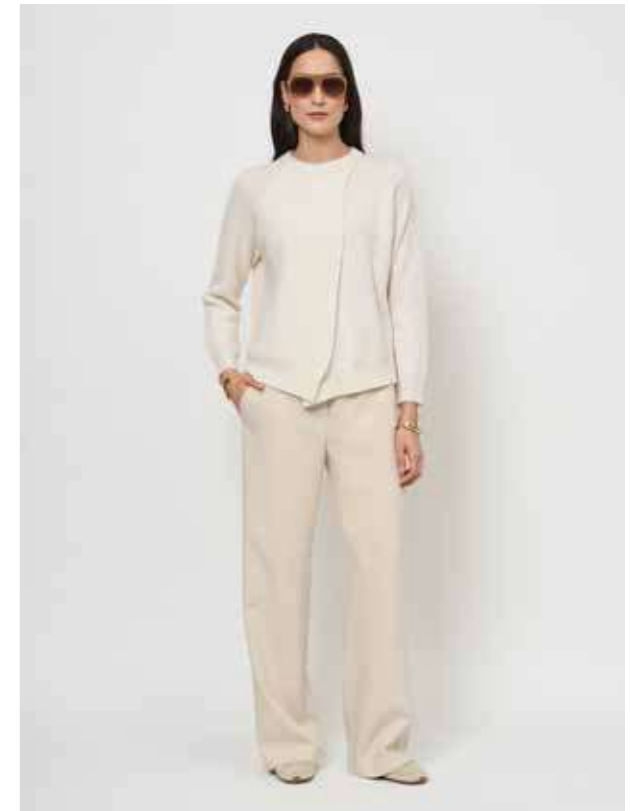
52.GB.03 Wool front flap sweater | 52.RA.12 Viscose blend straight pants