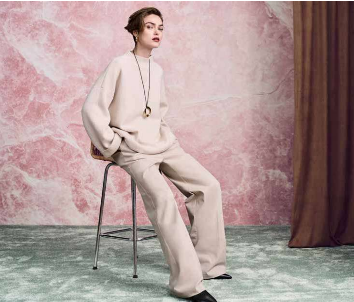
52.AN.05 Cashmere blend sweater | 52.RA.17 Cotton wide leg trousers