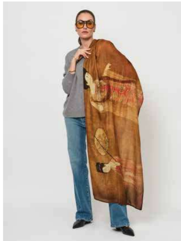
52.BS.03 Double sided scarf - Geisha 80% modal/20% silk