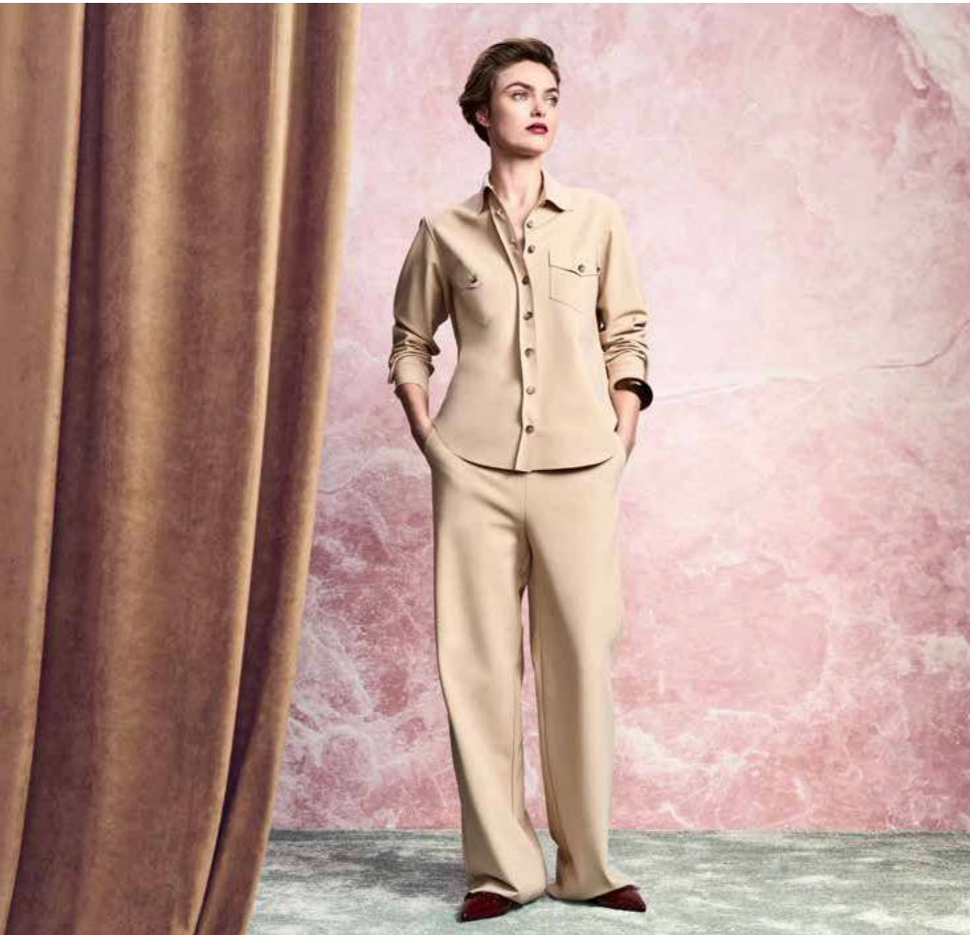
52.AT.02 Bonded travel quality shirt | 52.AT.10 Bonded travel quality trouser