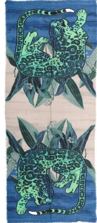
52AH09 - Tiger Green 80% Wool/20% Modal 100 x 180cm