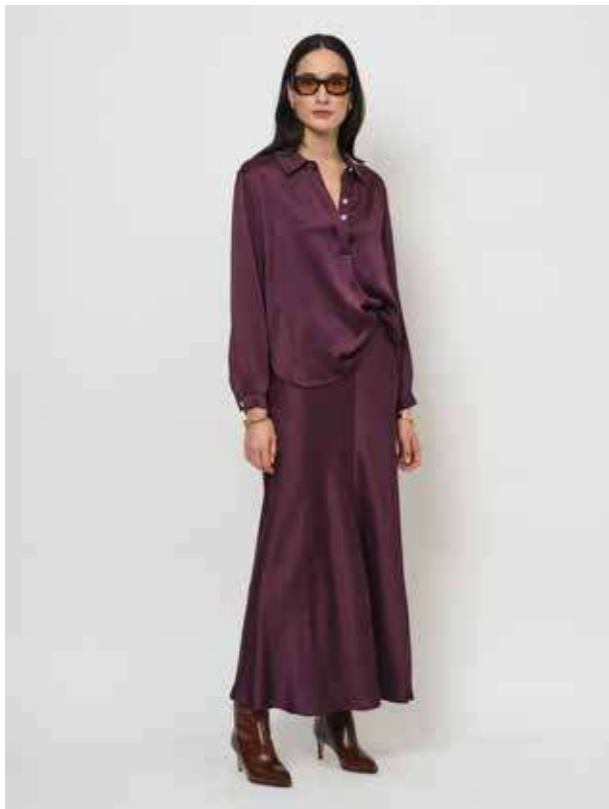
52.HV.07 Viscose blend V-neck loose fit top | 52.HV.05 Viscose blend A-line skirt