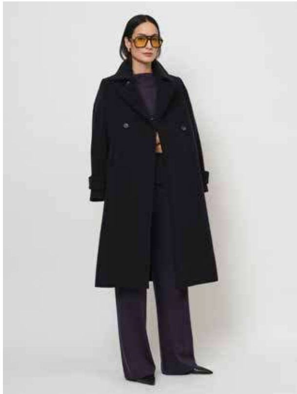
52.RA.02 Wool/cashmere long coat | 52.RA.06 Viscose punto raised neck top | 52.RA.07 Punto straight wide pants