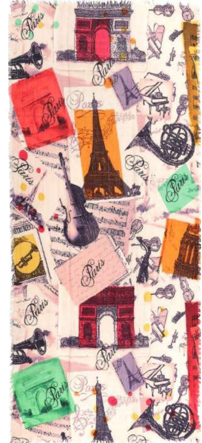
52AH03 - Paris 75% Wool/25% Modal 100 x 180cm