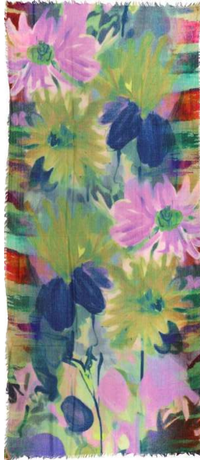
52AH35 - Vines 90% Modal/10% Silk 100 x 180cm