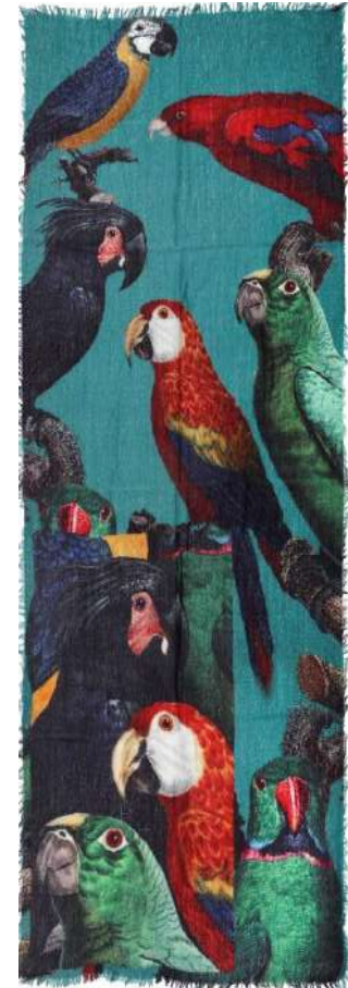
52AH45 - Parrots 100% Wool 70 x 180cm