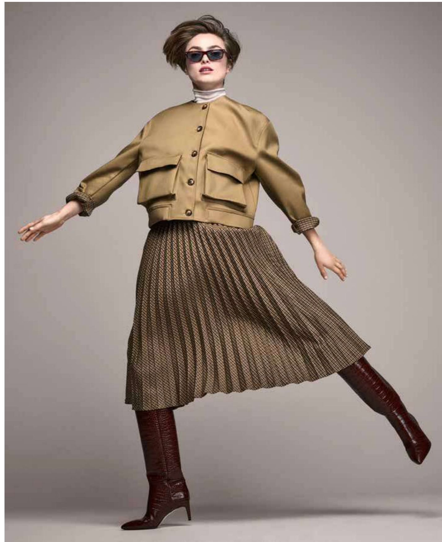
52.SC.04 Bomber jacket | 52.SC.03 Pleated skirt | 52.MA.09 Merino wool high neck sweater