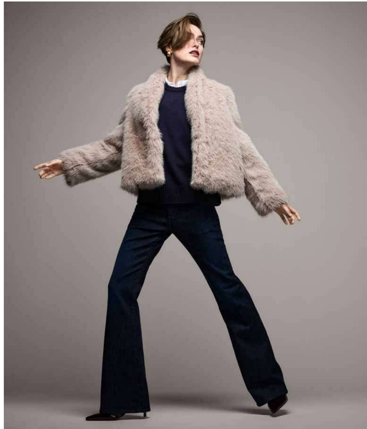
52.RA.03 Fake fur jacket | 52.CA.01 Cashmere blend sweater | 52.IV.81 Bootleg jeans