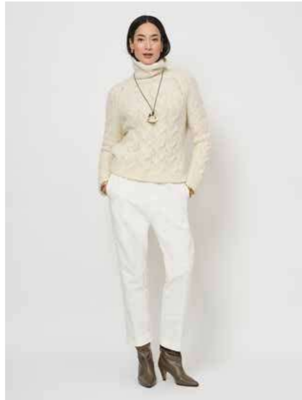
52.FM.07 Alpaca high neck sweater | 52.RA.19 Cotton cropped pants