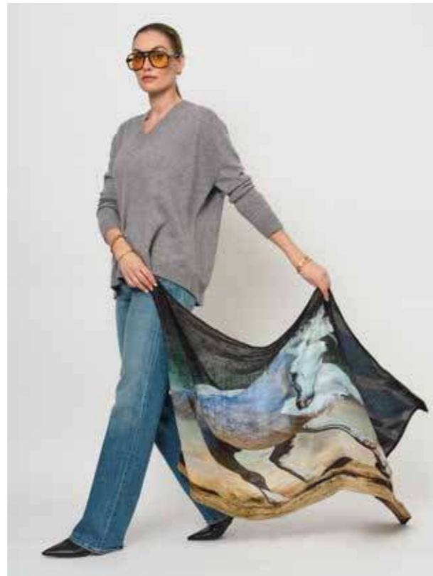
52.BS.04 Double sided scarf - Horse 80% modal/20% silk