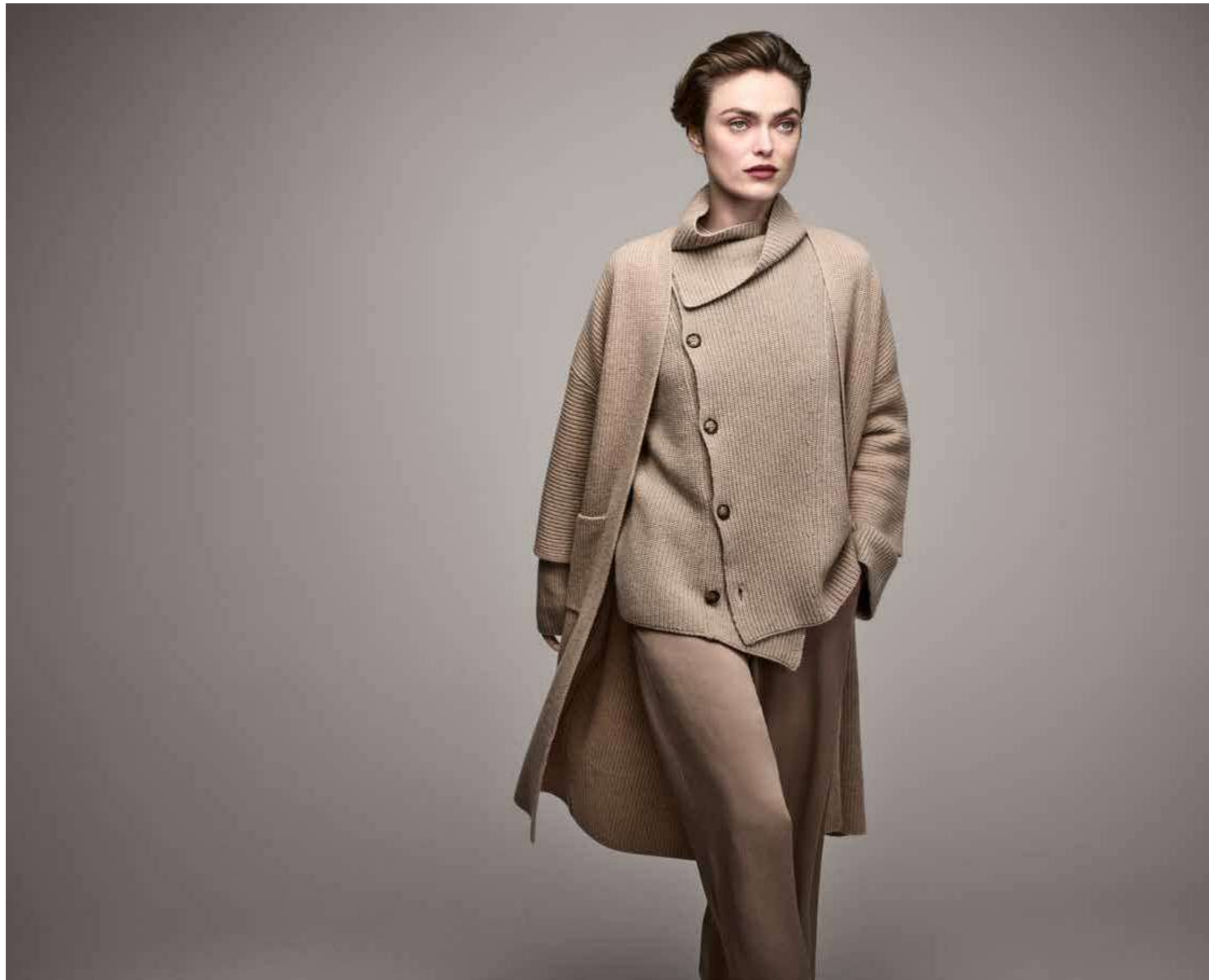
52.AN.01 Cashmere blend button cardigan | 52.GB.02 Cashmere blend open cardigan | 52.HV.06 Satin hammered viscose pants