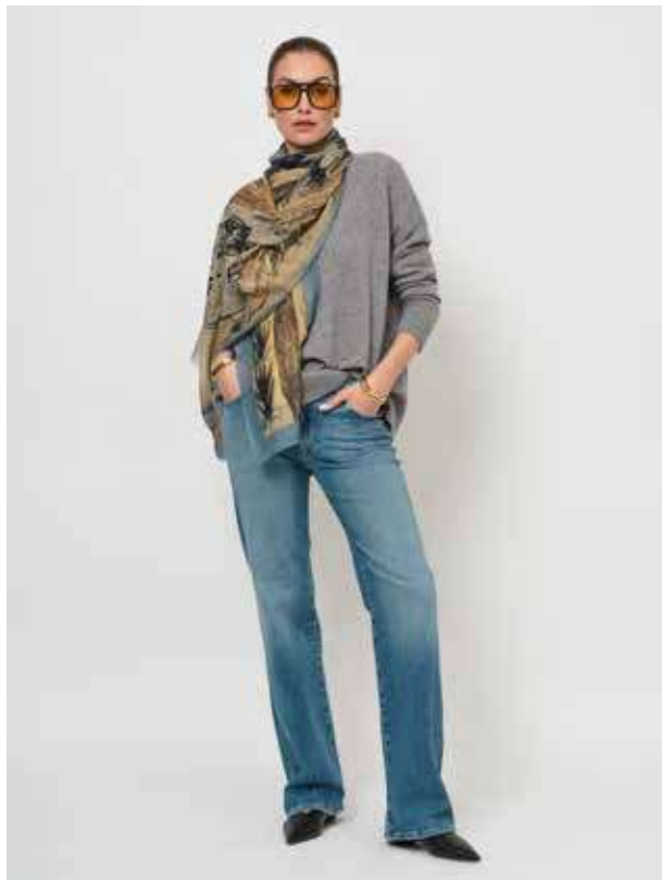
52.BS.15 Paradise Birds 100% wool