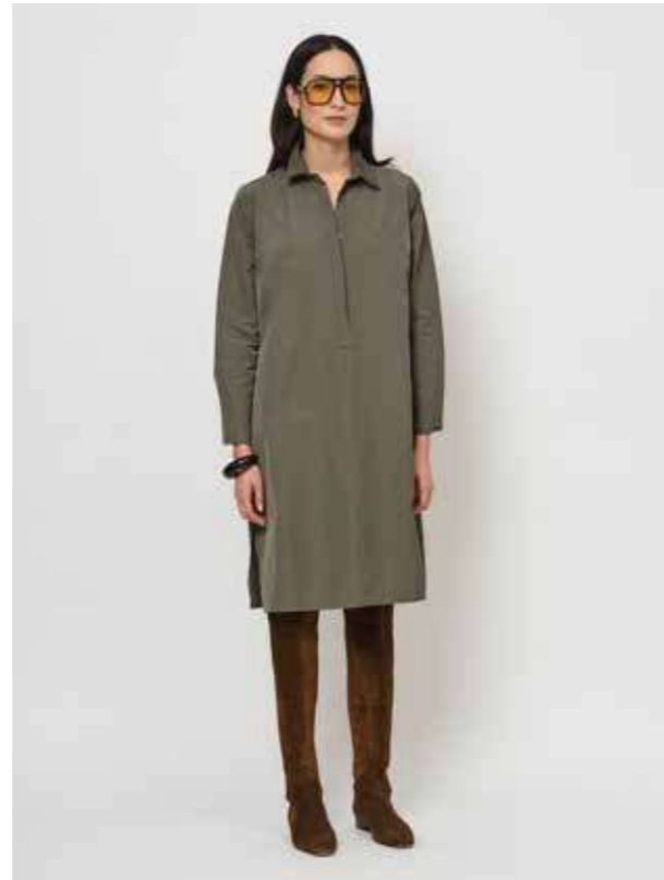
52.IV.64 Cotton taffeta shirt dress