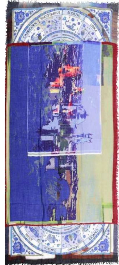
52AH39 - Astrology 90% Modal/10% Silk 100 x 180cm