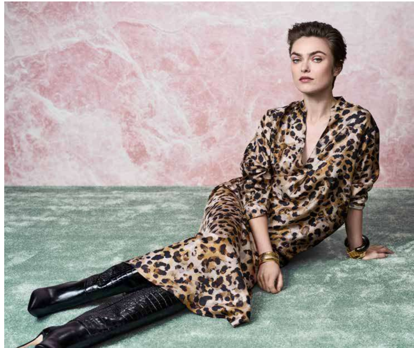
52.SI.01 Pop over silk top | 52.SI.07 Silk A-Line skirt