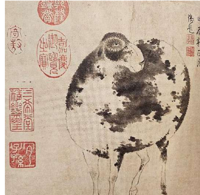
52AH61 - Ram Lady 90% Modal/10% Silk 140 x 140cm