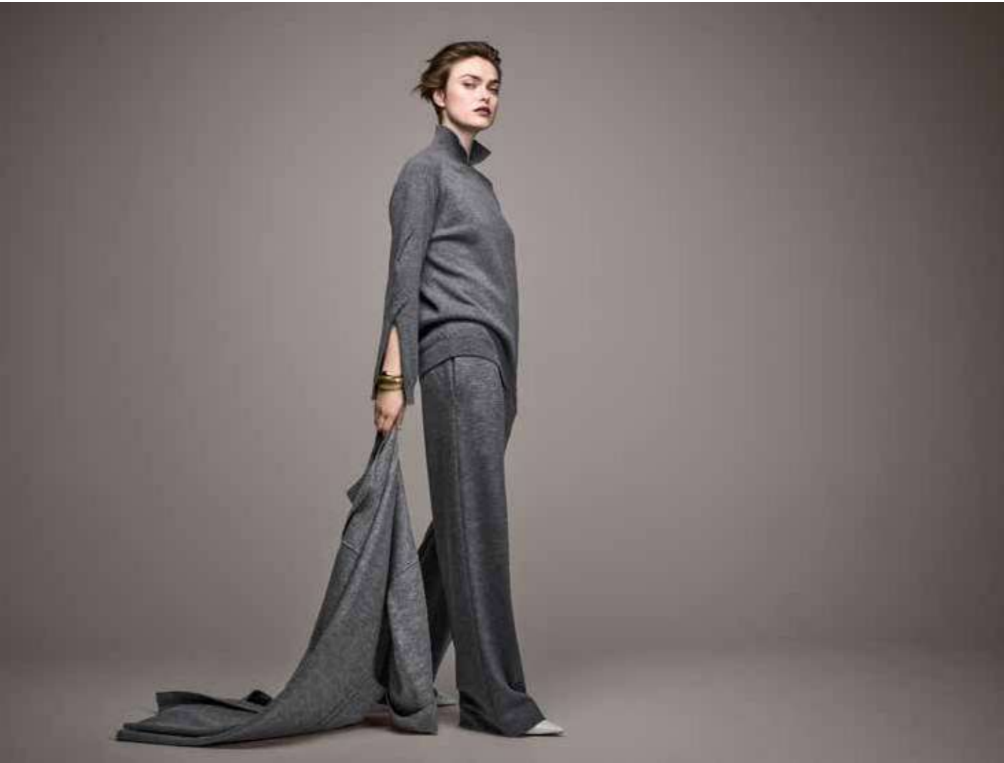
52.CA.02 Cashmere blend sweater | 52.WP.04 Wide leg wool punto trousers | 52.RA.15 Long boiled wool coat