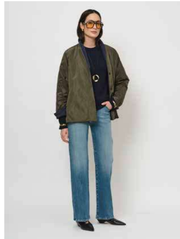
52.CA.01 Wool/cashmere crew neck sweater | 52.SO.10 Puff oversized jacket | 52.IV.81 Bootcut jeans