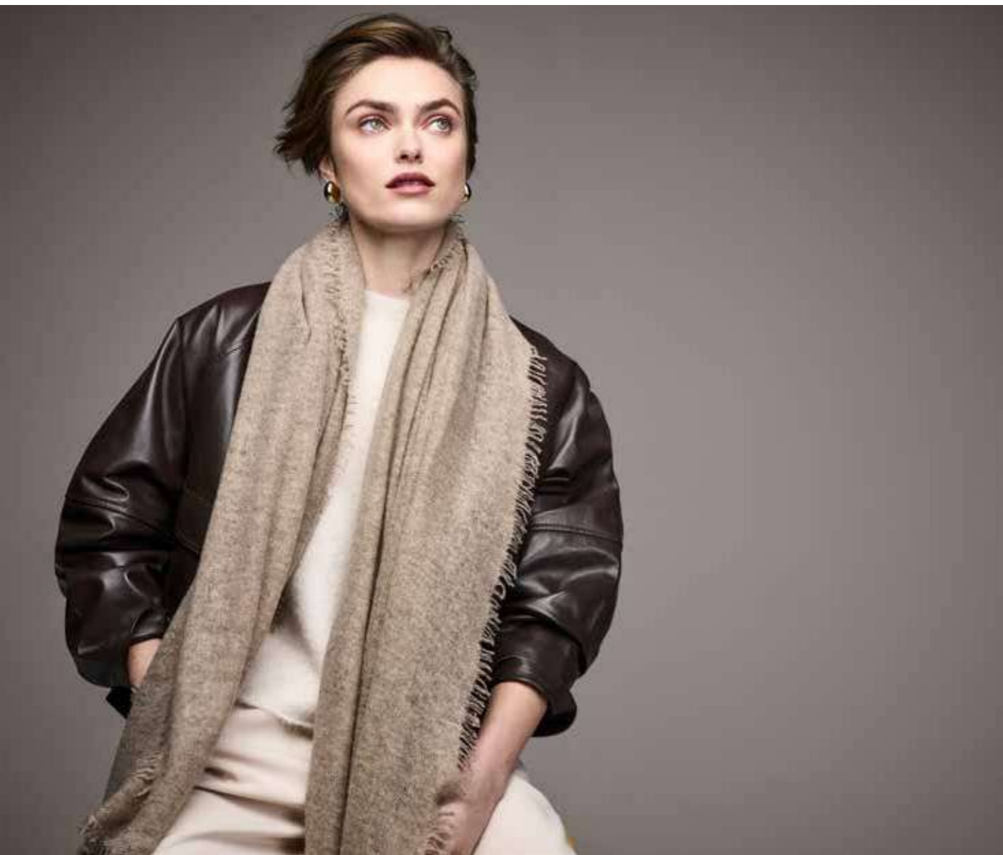
52.FK.12L Short leather jacket | 52.MA.04 Short sleeve alpaca crew neck sweater | 52.TN.05 Cashmere scarf | 52.RA.12 Viscose blend trousers