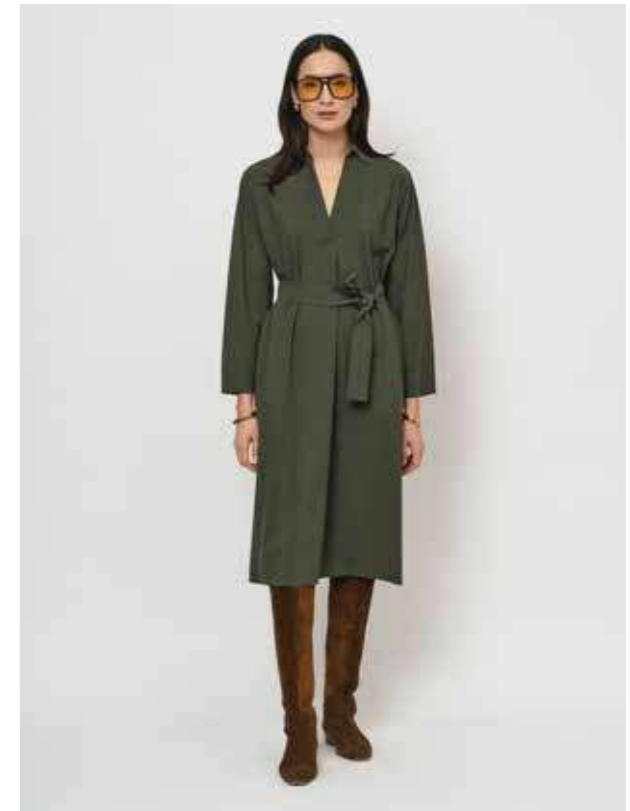
52.AT.14 Travel quality shirt dress