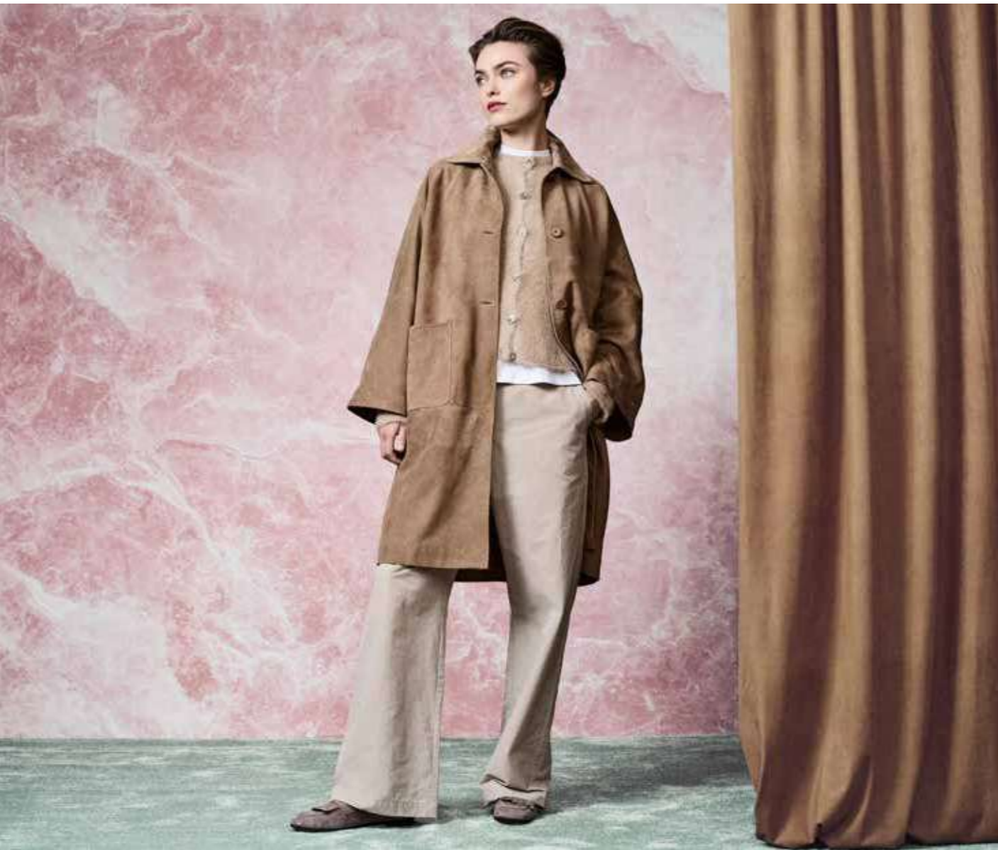
52.FK.01S Suede jacket | 52.MA.01 Alpaca cardigan | 52.IV.67 Cotton taffeta trousers