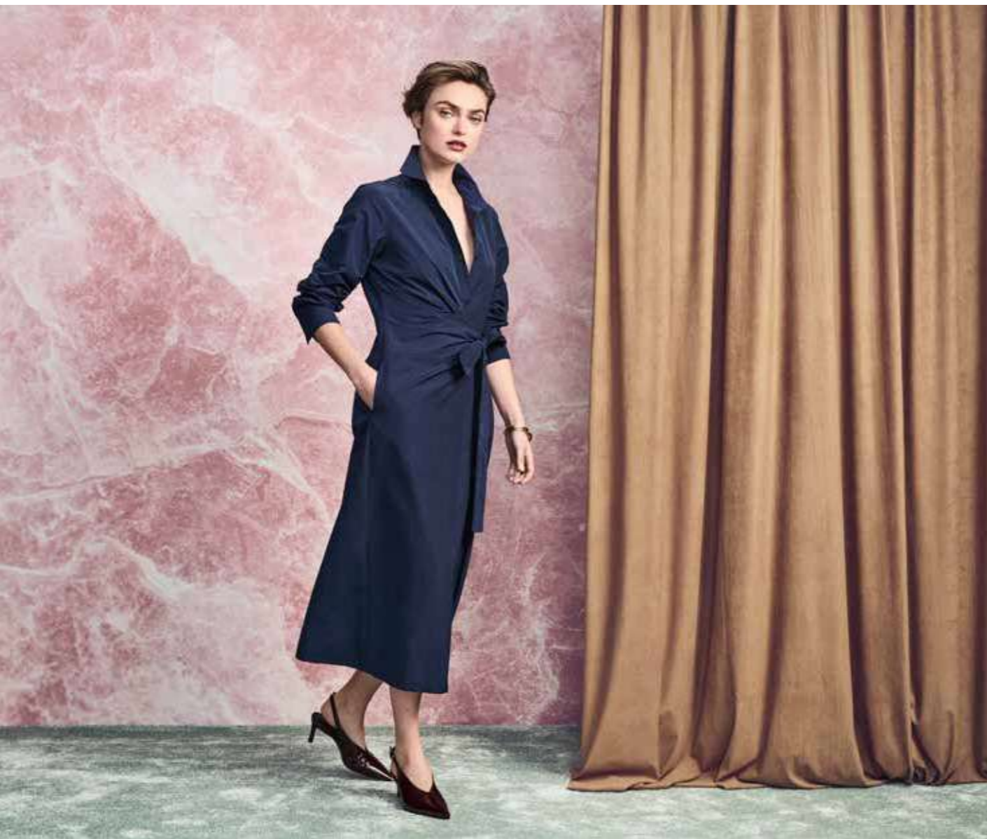
52.IV.65 Cotton taffeta side tie dress