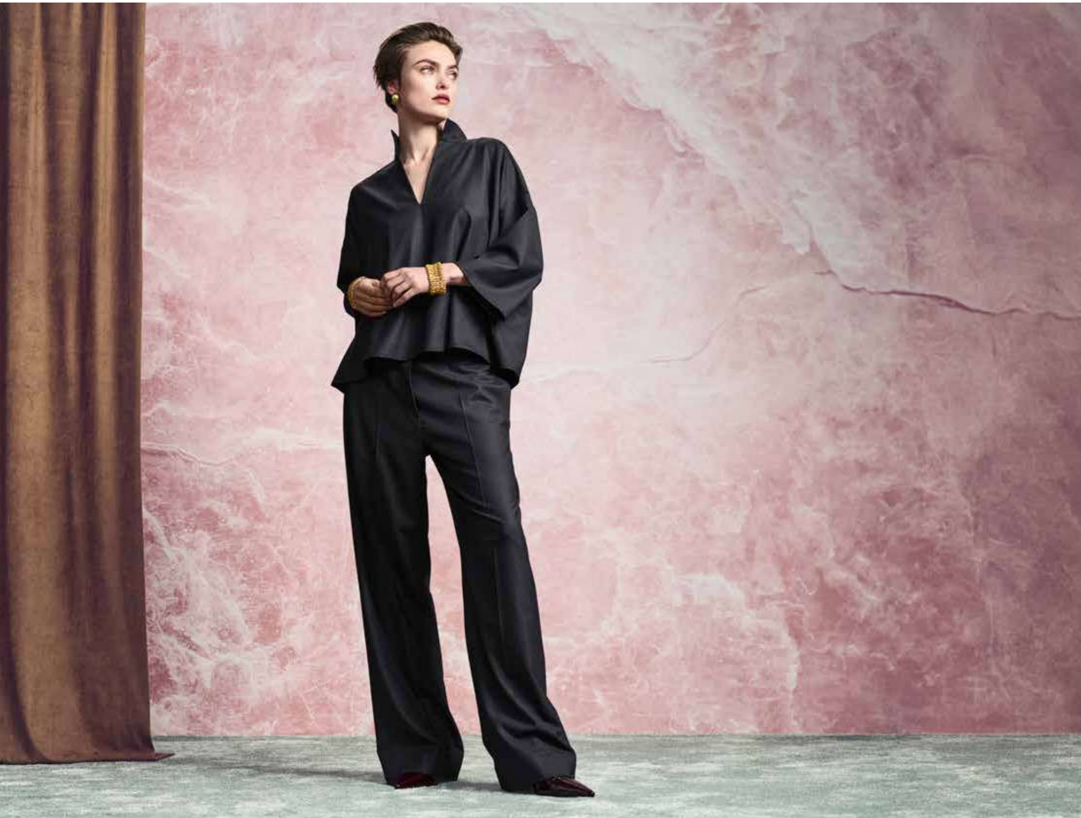
52.WO.08 Wool blend boxy top | 52.WO.09 Wool blend trousers