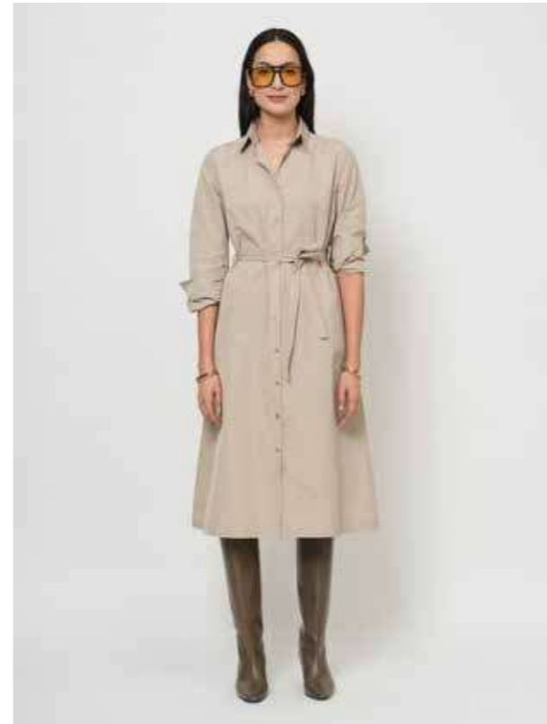
52.IV.66 Cotton taffeta shirt dress