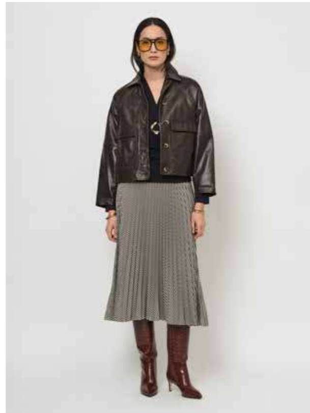
52.VI.19 Tencel wrap top long sleeve | 52.SC.03 Pleated skirt 52.FK.12L Leather short jacket