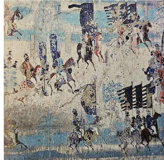
52AH63 - War and Peace 90% Modal/10% Silk 140 x 140cm