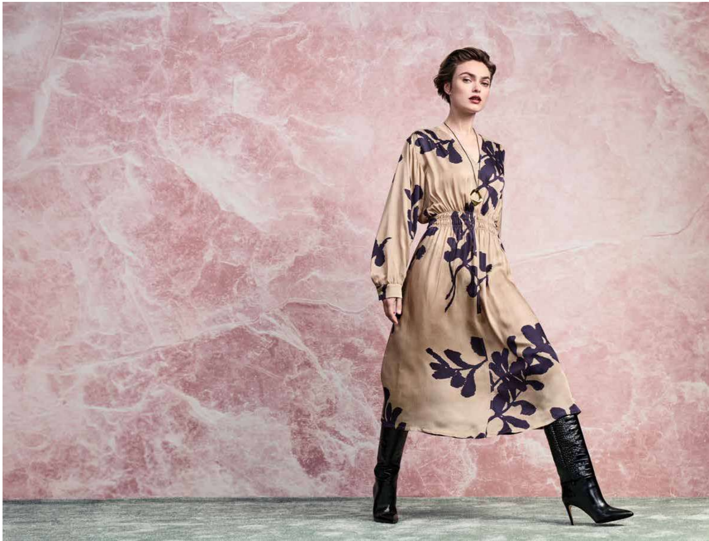
52.HP.01 Viscose smock dress