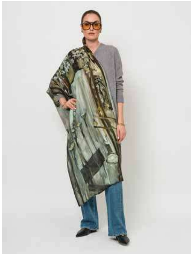
52.BS.06 Double sided scarf - Cafe and Paint 80% modal/20% silk