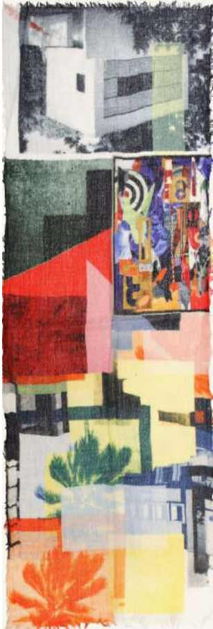
52AH01 - Miami 100% Wool 70 x 180cm