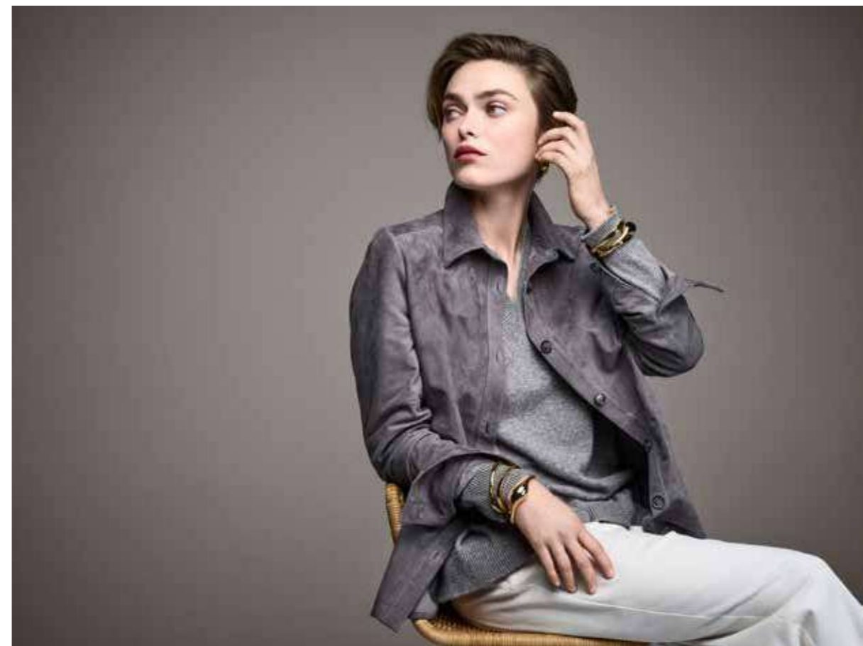
52.FK.08S Suede shirt | 52.PM.15 Cashmere V-neck sweater | 52.RA.19 Cropped cotton trousers