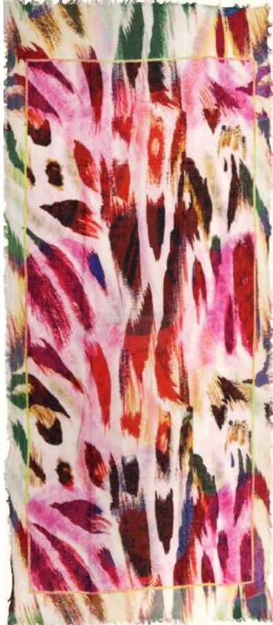
52AH34 - Pink Leo 90% Modal/10% Silk 100 x 180cm