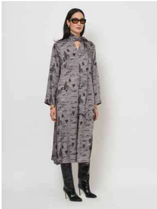
52.HP.03 Viscose shawl neck dress