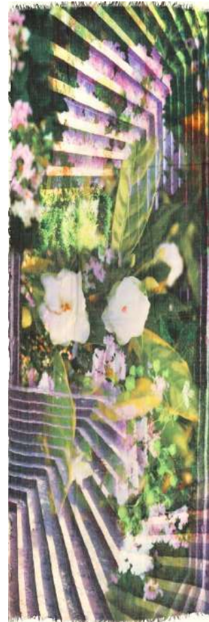
52AH08 - White Lilies 75% Wool/25% Modal 70 x 180cm