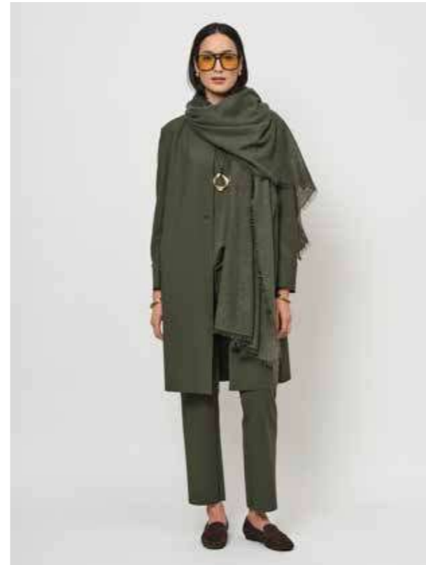
52.AT.01 Bonded travel quality jacket | 52.PM.14 Cashmere poncho sweater | 52.AT.08 Bonded travel quality slim leg trousers 52.TN.05 Cashmere scarf