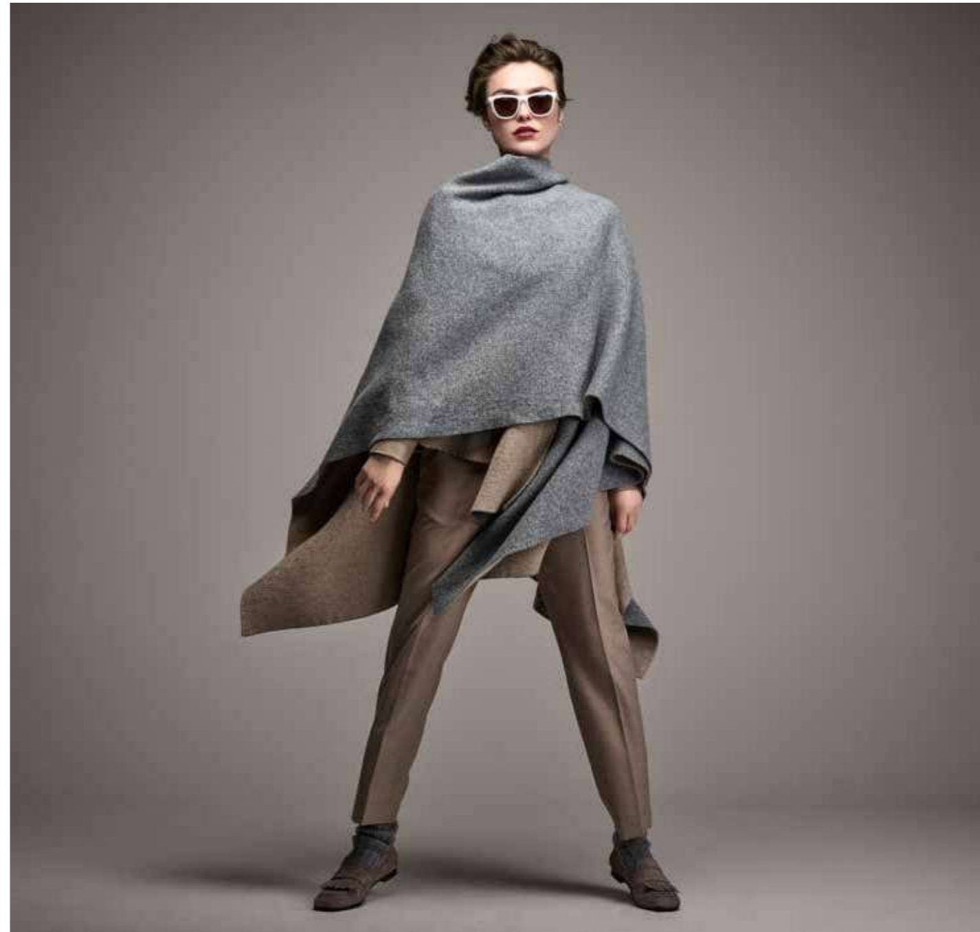
52.AN.04 Two-tone cashmere blend poncho | 52.WO.03 Wool blend shirt | 52.WO.04 Wool blend slim trousers