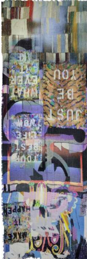
52AH10 - Graffiti 75% Wool/25% Modal 70 x 180cm